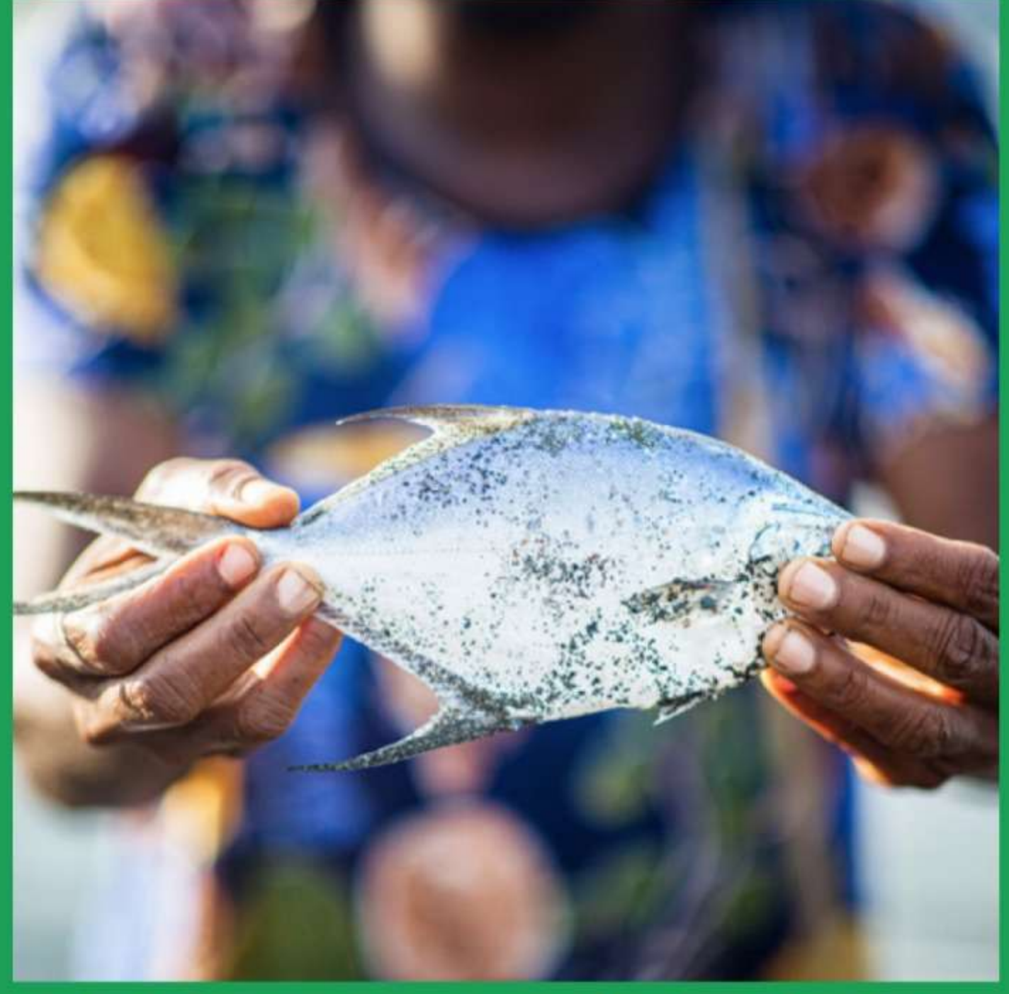
Fishers in West Santo Province, Vanuatu are seeing decreasing fish sizes in their catch.